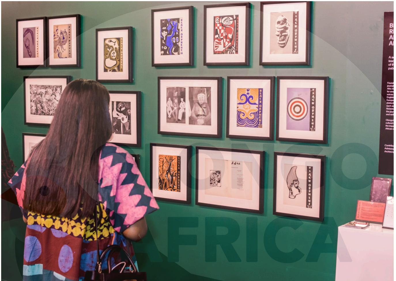
A photo from our Black Orpheus Revisited Exhibition at Art X Lagos in November 2022.